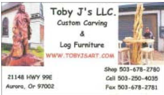
Pioneer Banquet Sponsor